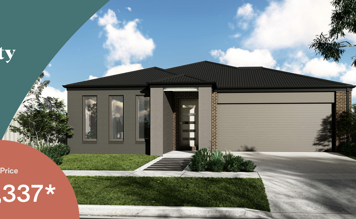
Image & facade shown for illustrative purposes