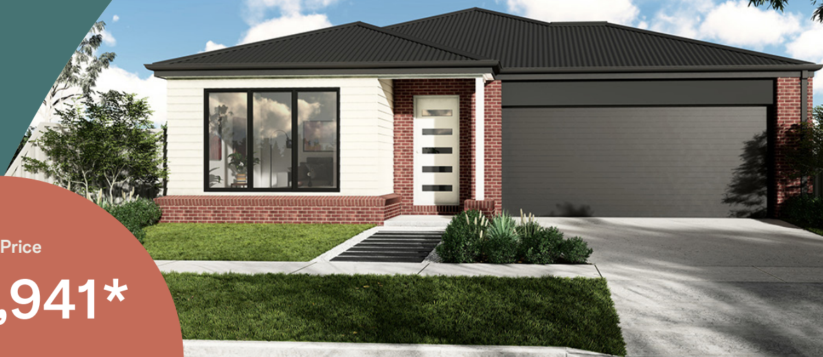
Image & facade shown for illustrative purposes