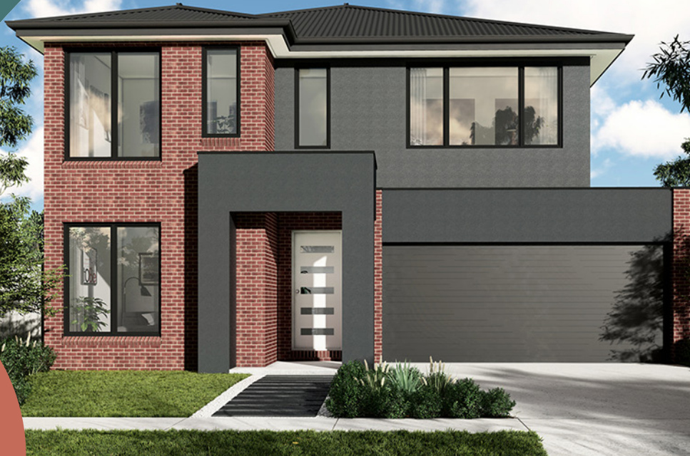
Image & facade shown for illustrative purposes