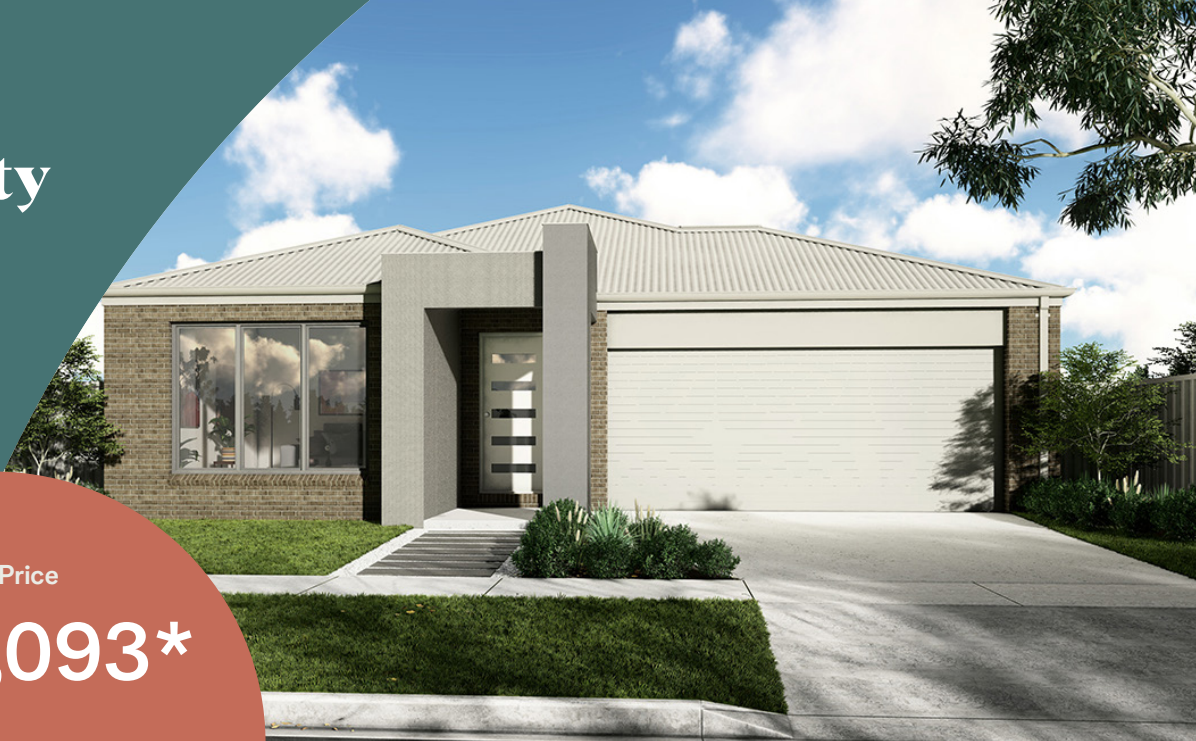
Image & facade shown for illustrative purposes