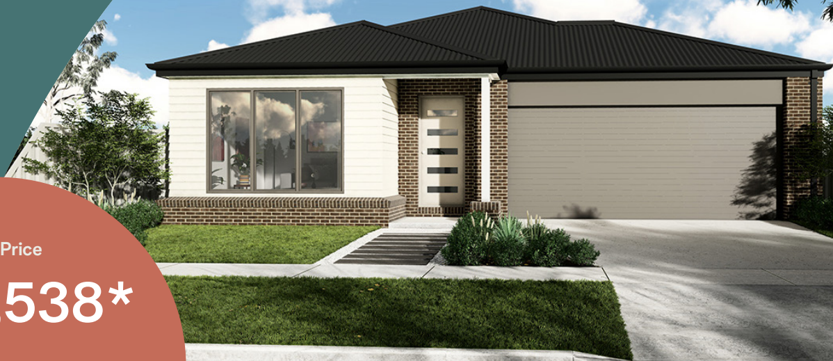
Image & facade shown for illustrative purposes