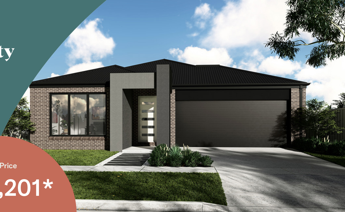
Image & facade shown for illustrative purposes