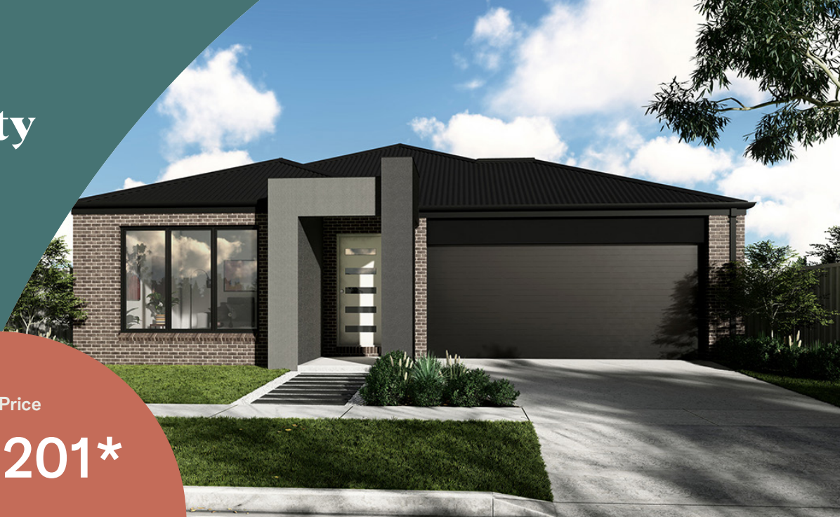
Image & facade shown for illustrative purposes