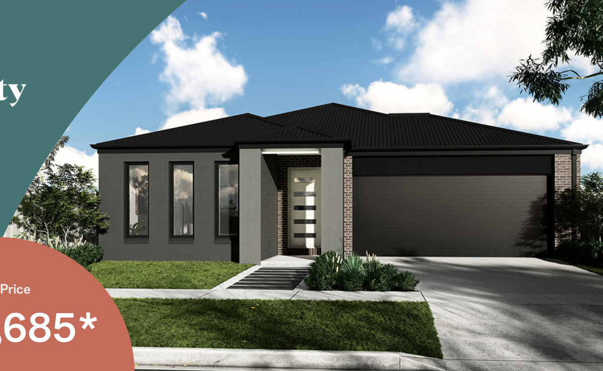
Image & facade shown for illustrative purposes