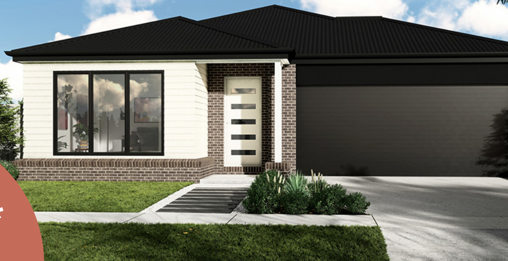
Image & facade shown for illustrative purposes