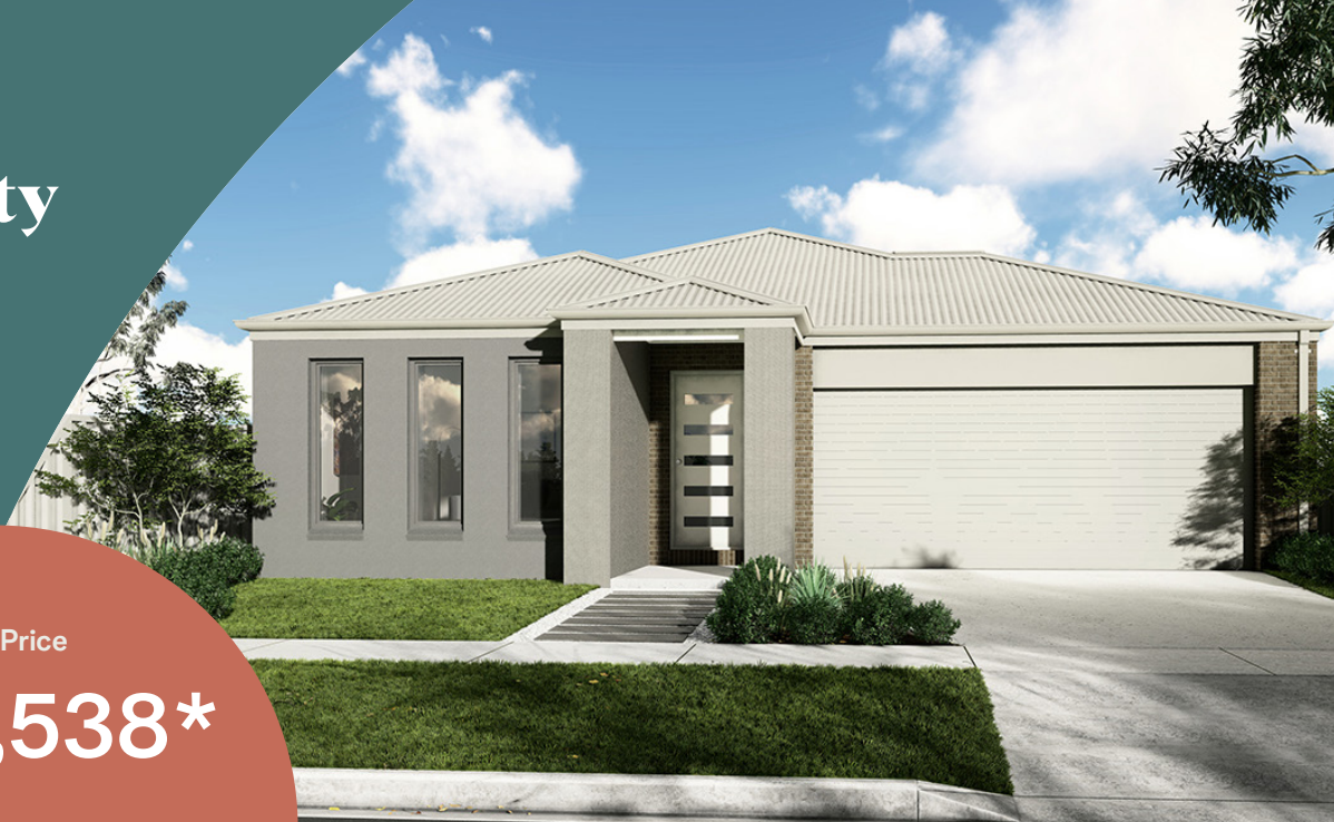
Image & facade shown for illustrative purposes