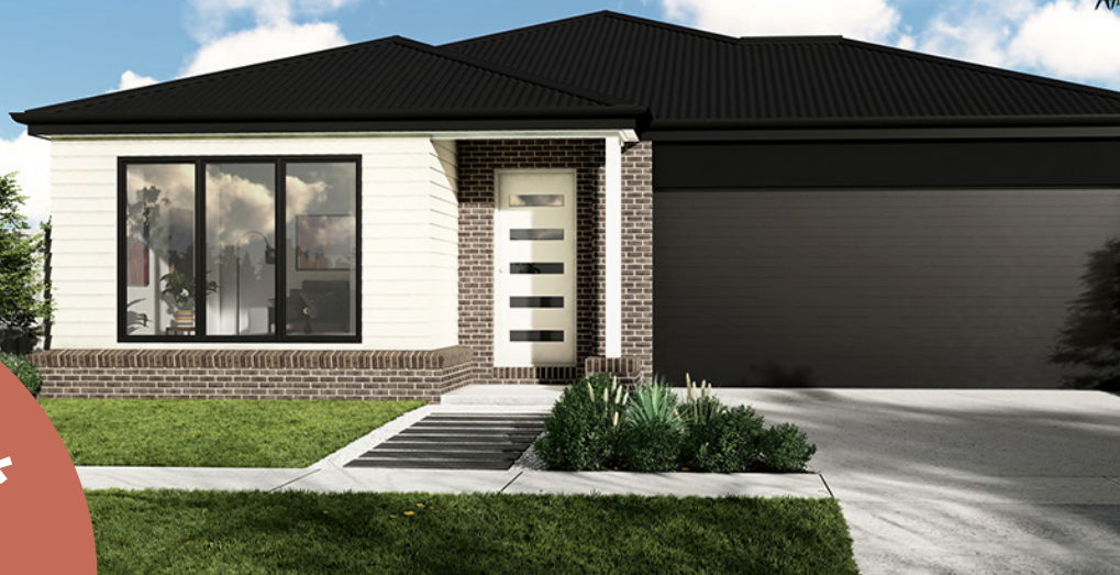
Image & facade shown for illustrative purposes