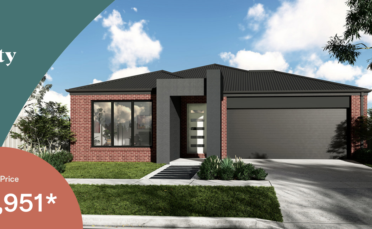
Image & facade shown for illustrative purposes