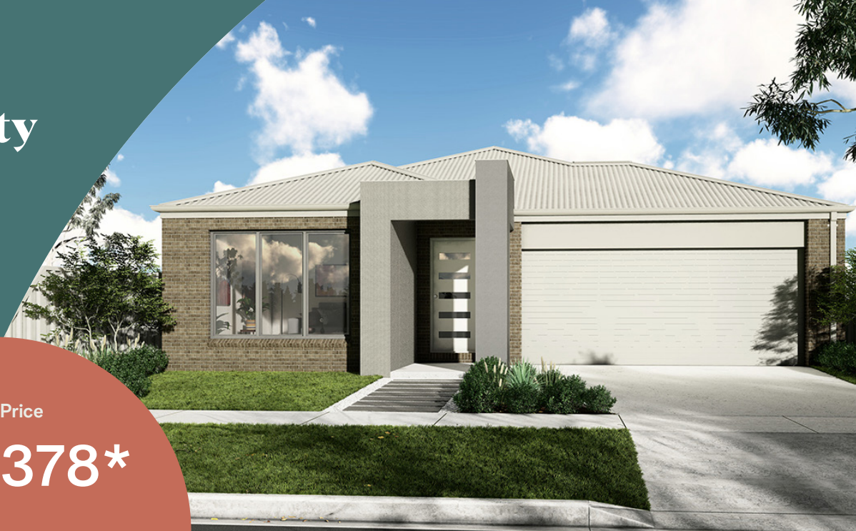
Image & facade shown for illustrative purposes