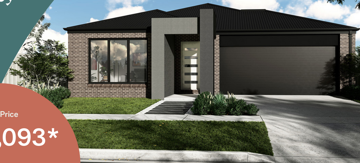
Image & facade shown for illustrative purposes