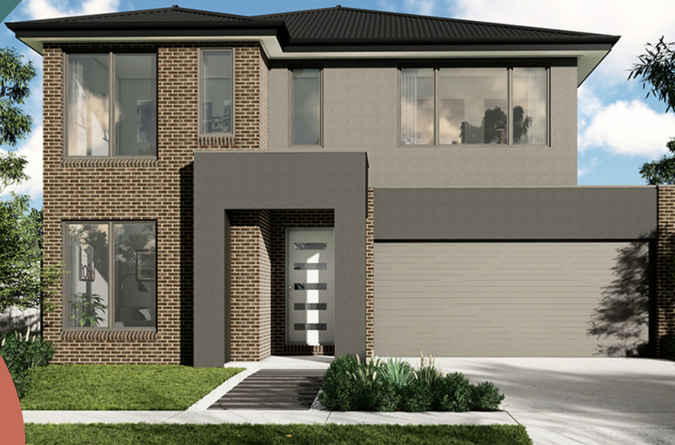
Image & facade shown for illustrative purposes