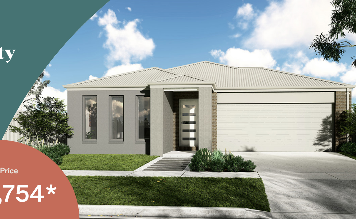
Image & facade shown for illustrative purposes