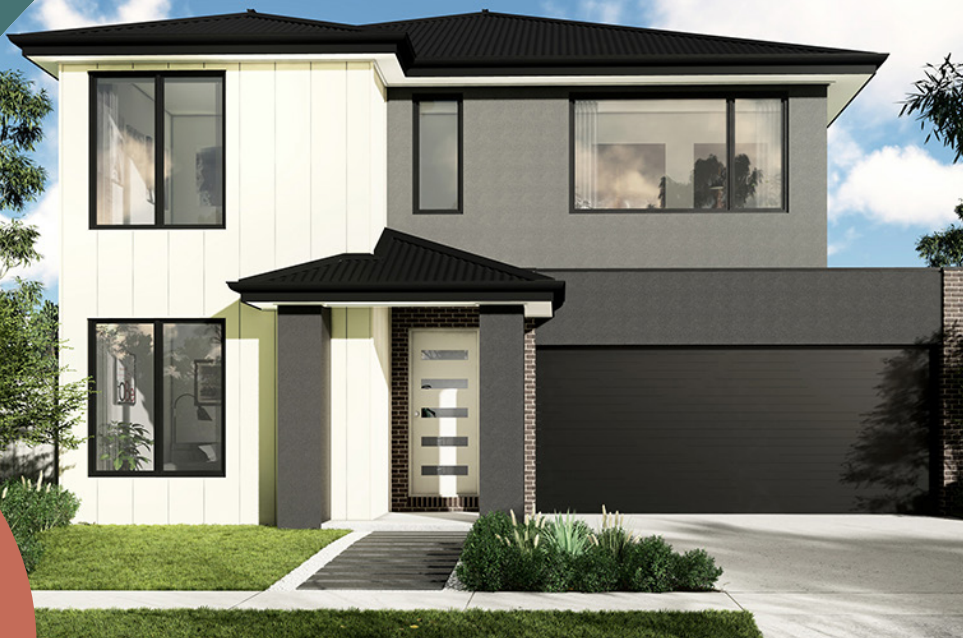
Image & facade shown for illustrative purposes