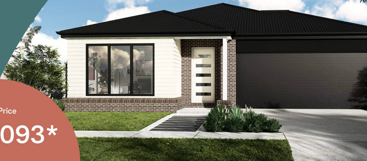
Image & facade shown for illustrative purposes